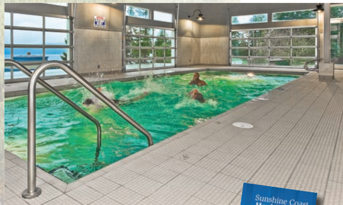
Our exercise pool.

(* ) Note: 12-step components include weekly attendance at AA/NA meetings, a weekly theme based on the spiritual principles of AA, and a Friday psycho-education group on the 12-Steps.