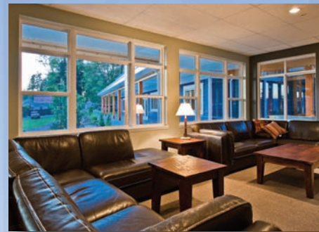
Right: clients have their choice of several separate lounges.

complimentary massage, ozone therapy, art classes, fitness and relaxation therapy throughout a client's stay. For added privacy, private accommodations are now available.