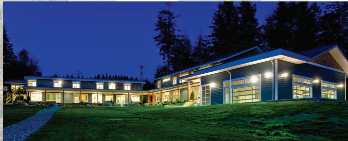
Below: the main residence and pool complex at Sunshine Coast.

‘So close and yet so far’ is an apt description of our treatment setting where clients are close to the many amenities and services of Powell River yet far from the hustle and bustle of big city life. Situated on five rural acres of oceanfront property, the campus at Sunshine Coast is the ideal setting for those embarking on their journey to recovery.