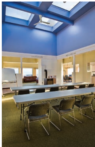
Top: the pool complex. Above: the Renewal Center.

Sunshine Coast Health Center focuses on providing the most effective, evidence-based treatment, exceeding expectations by paying close attention to four key therapeutic principles: