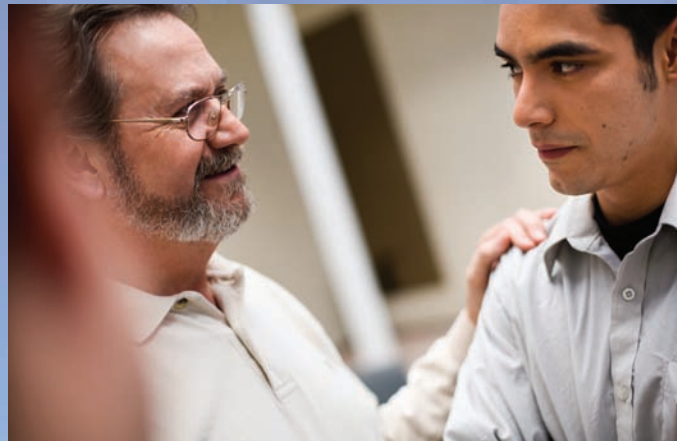
Above: a stronger peer group is just one of the advantages of being exclusively male.

Sunshine Coast Health Center understands that clients who enjoy their surroundings have a higher likelihood of staying in treatment and, therefore, have better long-term prospects for recovery. Our five-acre campus is situated on private waterfront and features an abundance of lounge space and activity areas—an exercise pool, a fully-equipped gym (cardio equipment, free weights, nautilus equipment), walking trails on campus, a private beach and a basketball court. To help clients relax in their early recovery, Sunshine Coast also provides ►