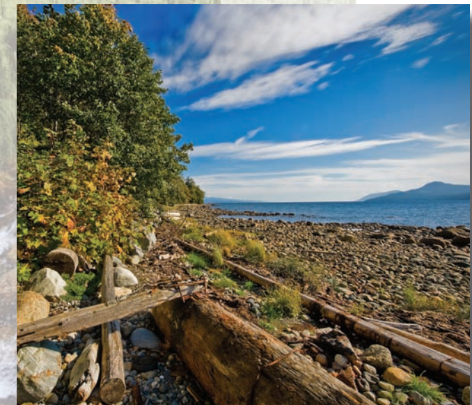
Below: our private beach.

Sunshine Coast offers complimentary services for alumni that includes a staff person dedicated to alumni support, reunions in select cities, weekend ‘booster’ sessions and online support. * (* Note: clients must have their own email address and internet connection.