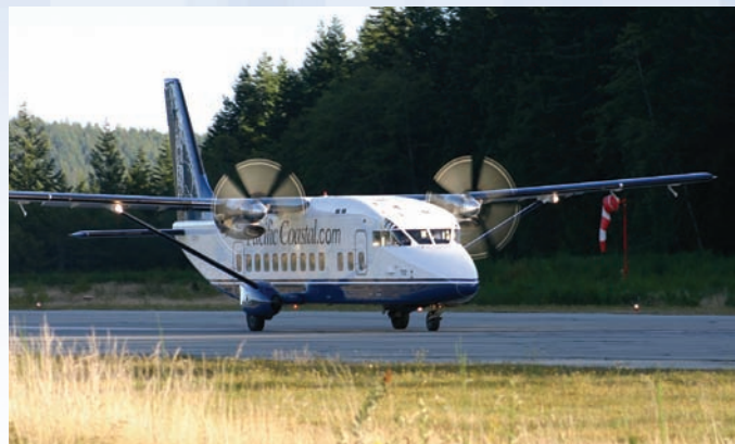
With five daily flights from Vancouver and WestJet service to Comox, travel from major cities in the Pacific Northwest and western Canada is simple and convenient.

You deserve to make an informed choice! At Sunshine Coast, we're dedicated to being as transparent as possible. Call our Admissions Department any time, 7 days a week, toll-free at 1-866-487-9010 or visit us on the web at www.schc.ca .