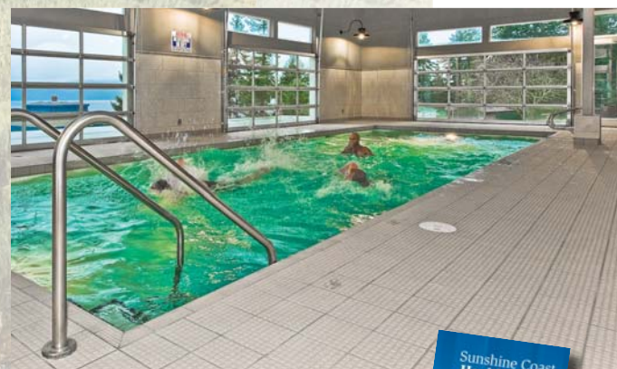
Our exercise pool.

(* ) Note: 12-step components include weekly attendance at AA/NA meetings, a weekly theme based on the spiritual principles of AA, and a Friday psycho-education group on the 12-Steps.