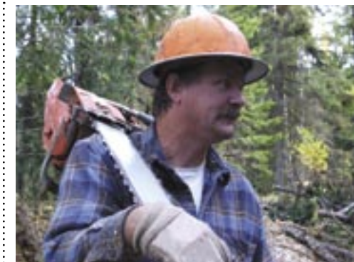
The forestry sector is an at-risk industry with many “safety-sensitive” occupations.

males 18 to 24 years of age, the demographic group most at risk for substance use. The safety-sensitive nature of many at-risk industries heightens concerns that substance abuse or use while at work may have serious implications for job performance and safety.