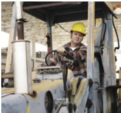
Reintroduce returning employees to work gradually.

Return-to-work programs are a common method of helping an injured worker reintegrate into the workplace as quickly and safely as possible. Just like an injury, returning to work after treatment for alcohol or drug addiction can be difficult. Counsellors at Sunshine