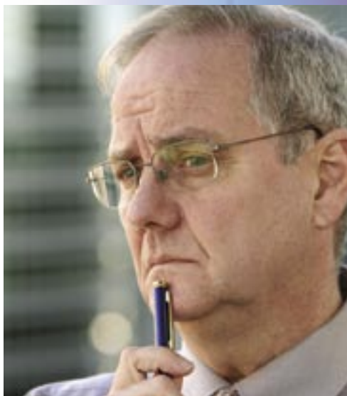
With treatment, a person with an addiction can achieve a healthy and productive lifestyle..

One of the most peculiar aspects of substance abuse is that those affected have great difficulty identifying drugs or alcohol use as the source of their problems.