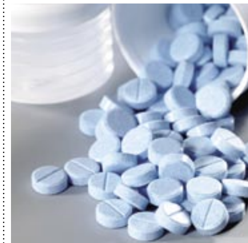
Medications have the potential to impair performance.

“Safety-critical” positions in the railway industry are defined as “positions directly engaged in the operation of trains, including rail traffic control.” These positions have a direct role in railway operations where impaired performance could result in a significant incident involving the public and environment. This concept is also applied to other modes such as marine and air transport.