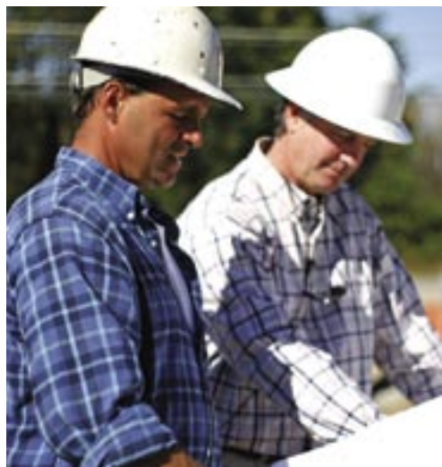
With proper planning you can readily implement a DFW program.

While you will not be able to create a drug-free workplace policy on your own, this guide will explain the key staff persons you will need to involve in this project and point out sections of the policy best left to specialists.