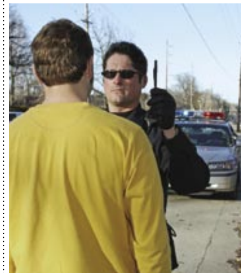
An employee may continue to drink or use drugs despite negative consequences.

used to help employees work longer hours. With such contributing factors, employees begin to identify these substances as a way of coping with feelings of exhaustion, boredom, loneliness, and isolation. Substance use, initially “enjoyed” with friends or co-workers on a recreational level, becomes increasingly an activity performed alone as a way of coping.