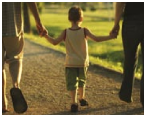
Your commitment to a drug-free workplace will benefit more than just your bottom line.

For a complimentary presentation on “You are the Key,” contact Sunshine Coast Health Centre at 1.866.487.9010. We’ll help you get started and connect you with other professionals in the field.