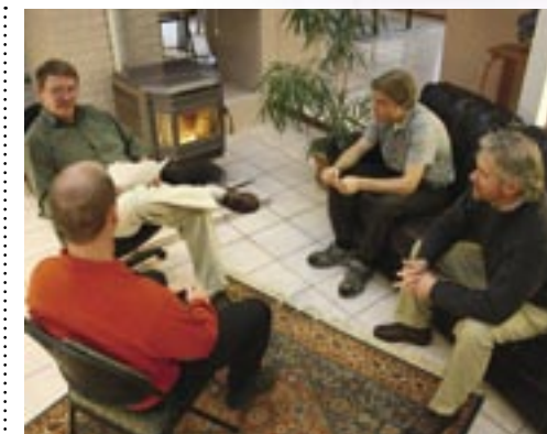
Residential treatment may be part of a comprehensive treatment plan.

Another important benefit of an assessment is to develop appropriate return to work provisions which, in turn, will be monitored to ensure an employee's compliance. As stated previously, return to work agreements