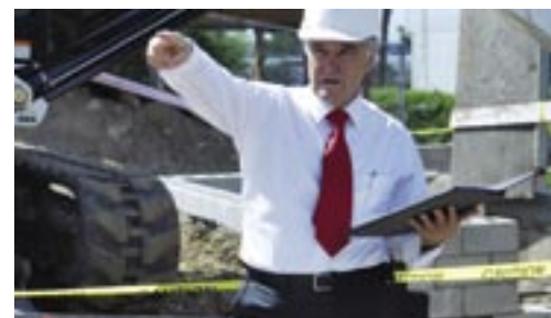
Supervisors should be trained to treat substance abuse as a health, safety and performance issue rather than a drug and alcohol problem.

(* Note: see Appendix for a checklist of warning signs and obvious indicators of drug or alcohol abuse.