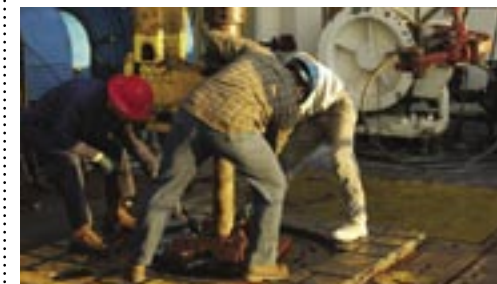
Designating "safety-sensitive" positions in an organization is the responsibility of the employer.