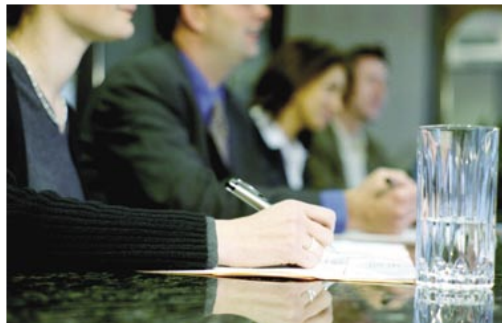
Employees need to be assured that if they have a problem, you will give them a chance to get help.

For information on workplace training, please contact BC Council on Substance Abuse at 1.250.649.4000.