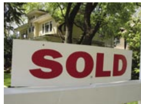
Real estate is just one of many white-collar industries that is at-risk for substance abuse.