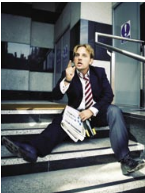
Know how to deal with a drug- or alcohol-related crisis.

Situations involving alcohol and other drugs can be difficult to manage, especially if you do not yet have a drug-free workplace policy in place. However, developing a policy takes time and, in the meantime, you may have to deal with a crisis at work.